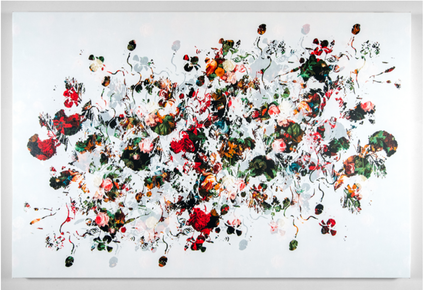
J Myszka Lewis, for we are only the rind and the leaf , 2024 Acrylic and archival inkjet on canvas; 48 x 72 inches; $8,000