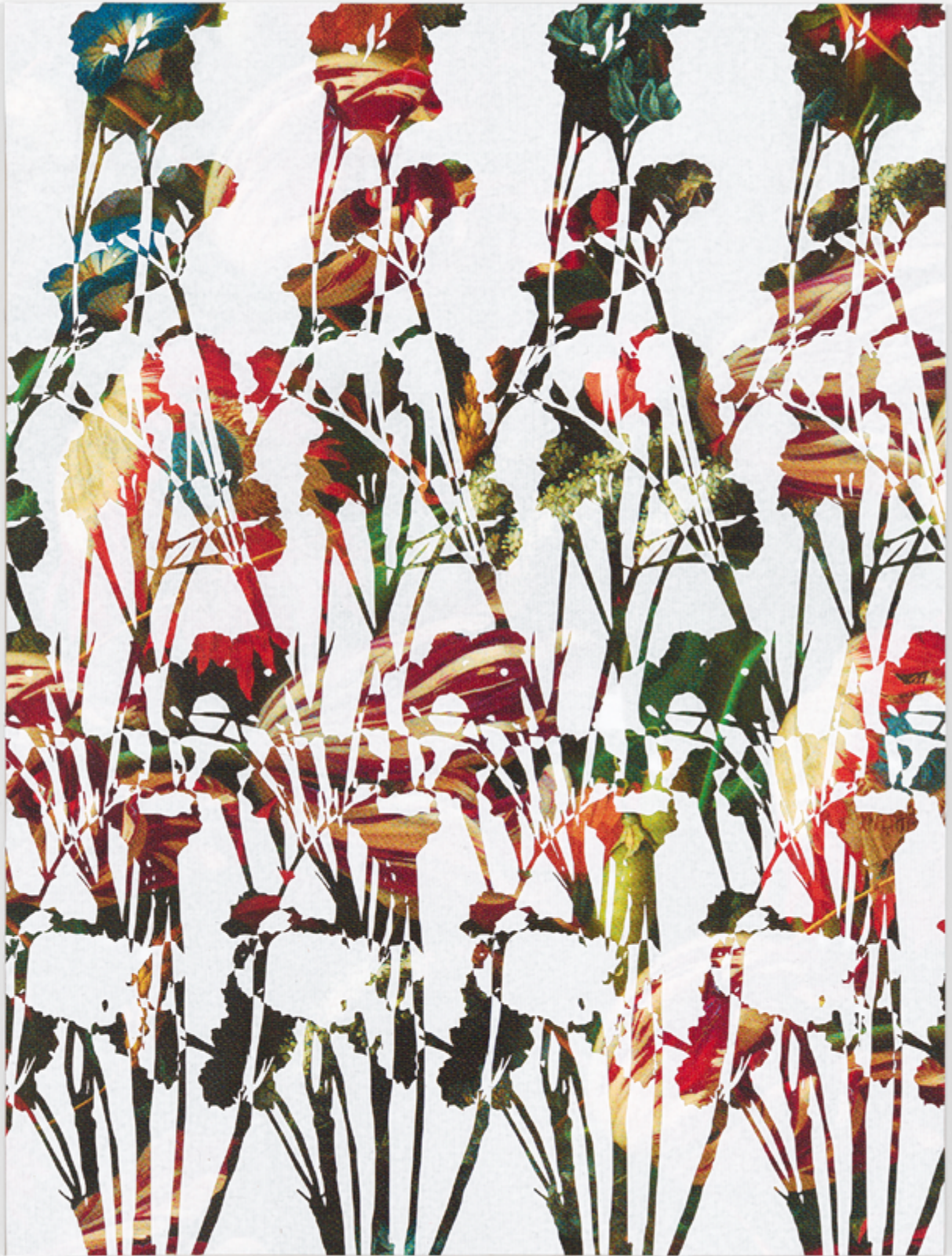
J Myszka Lewis, Botanical Screen 9 , 2023 Acrylic and archival inkjet on canvas mounted to panel; 9 x 12 inches; $350