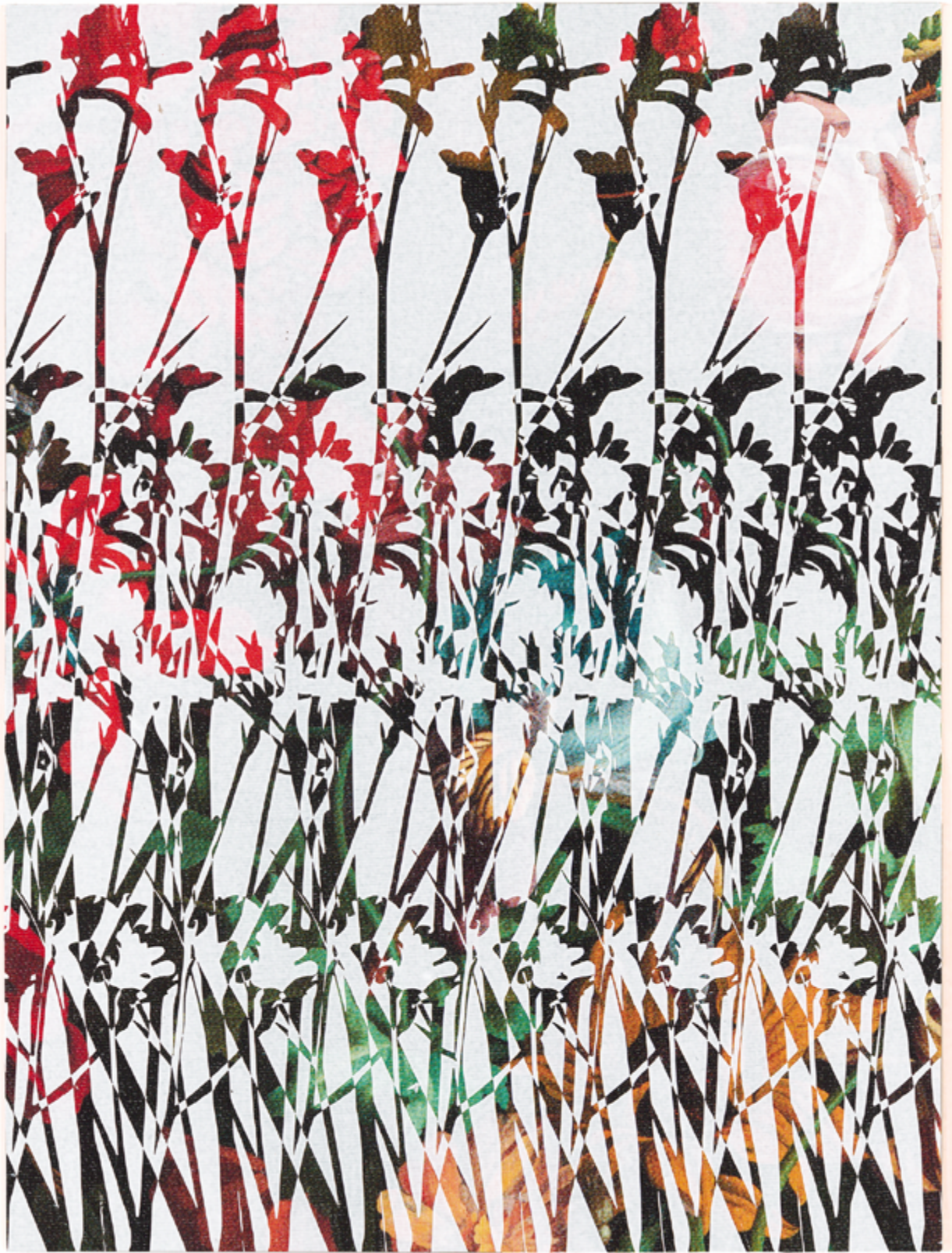
J Myszka Lewis, Botanical Screen 3 , 2023 Acrylic and archival inkjet on canvas mounted to panel; 9 x 12 inches; $350