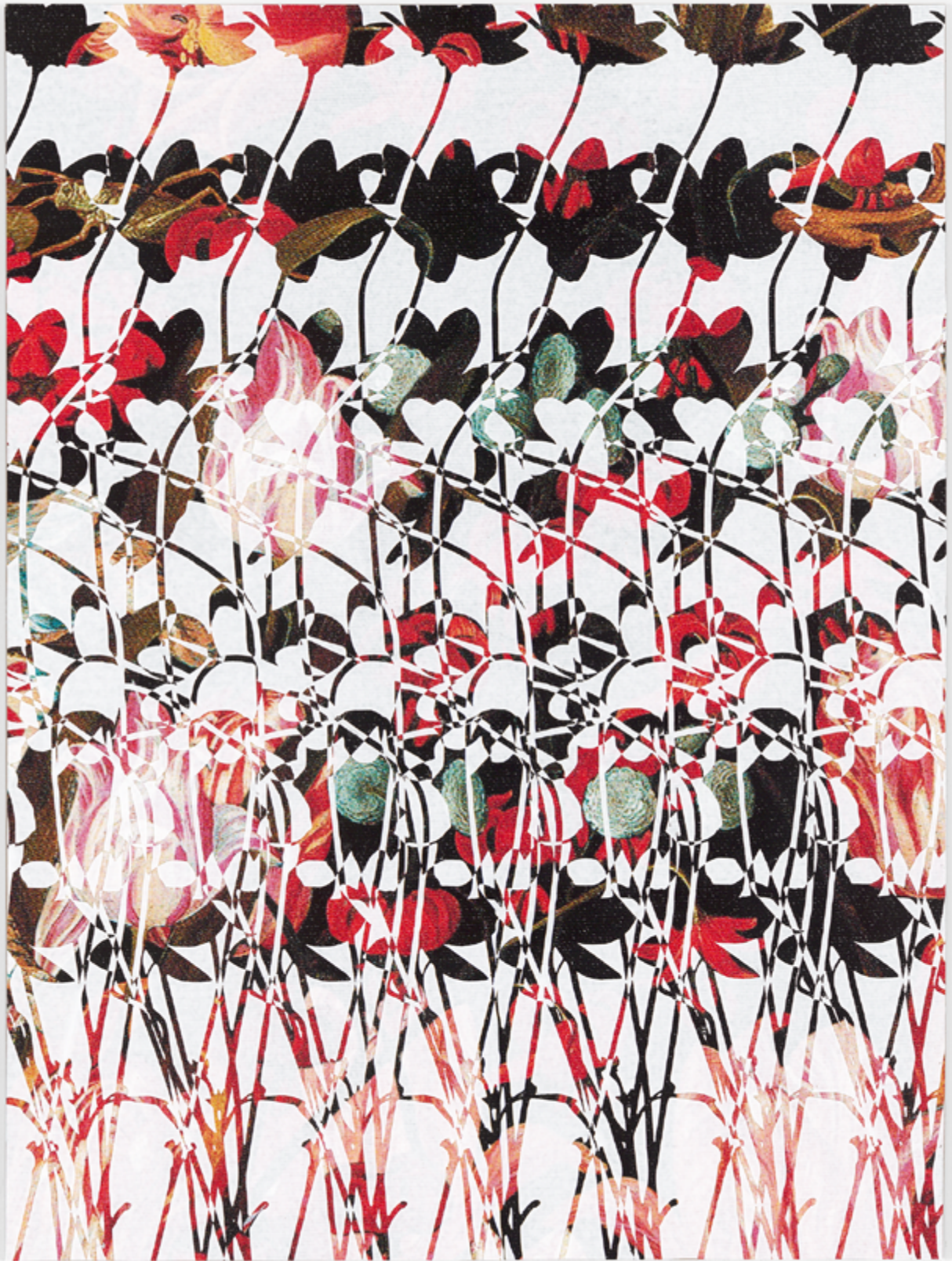
J Myszka Lewis, Botanical Screen 7 , 2023 Acrylic and archival inkjet on canvas mounted to panel; 9 x 12 inches; $350