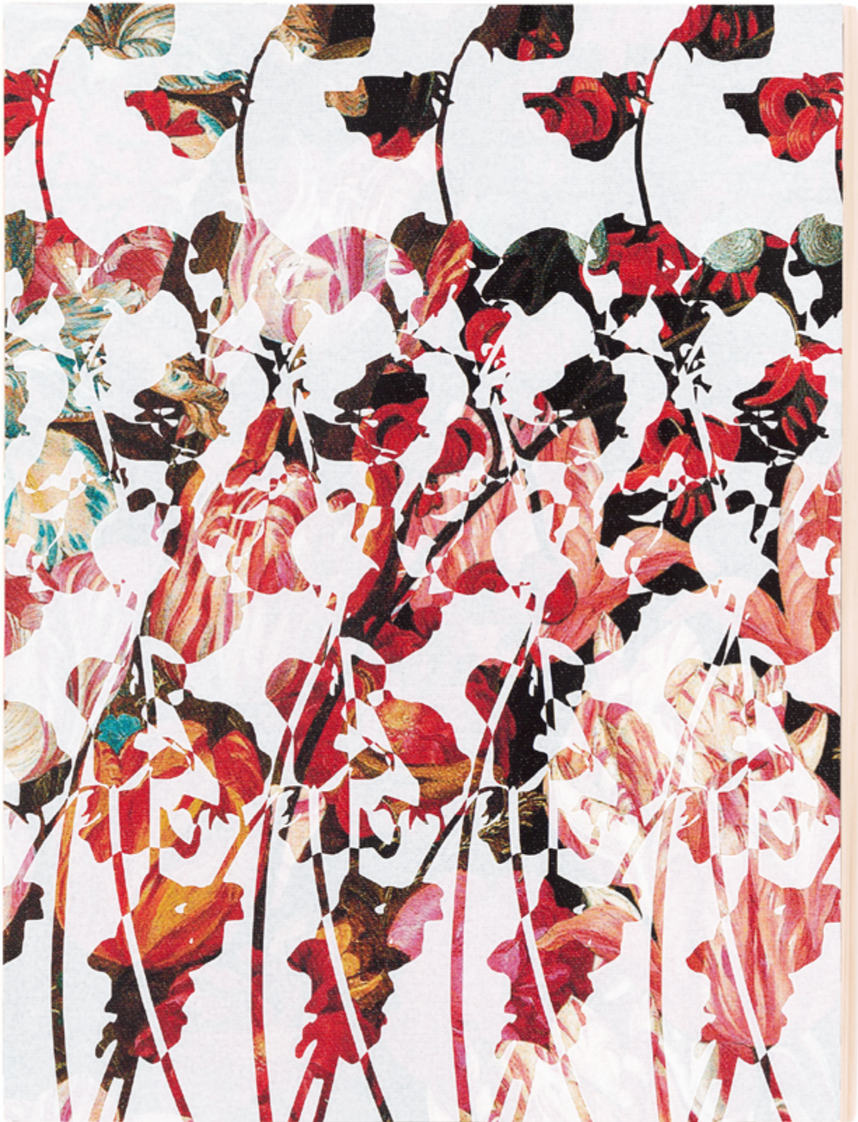
J Myszka Lewis, Botanical Screen 6 , 2023 Acrylic and archival inkjet on canvas mounted to panel; 9 x 12 inches; $350