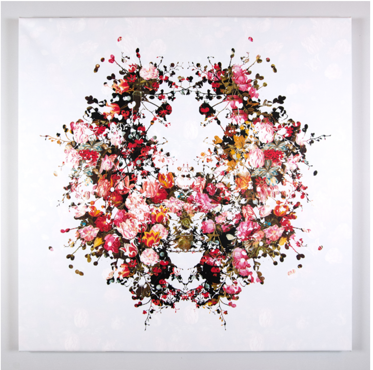
J Myszka Lewis, A Bouquet for Then and Now 5 (oncidium orchid, ranunculus, palm nut), 2023 Acrylic and archival inkjet on canvas; 48 x 48 inches; $5,000