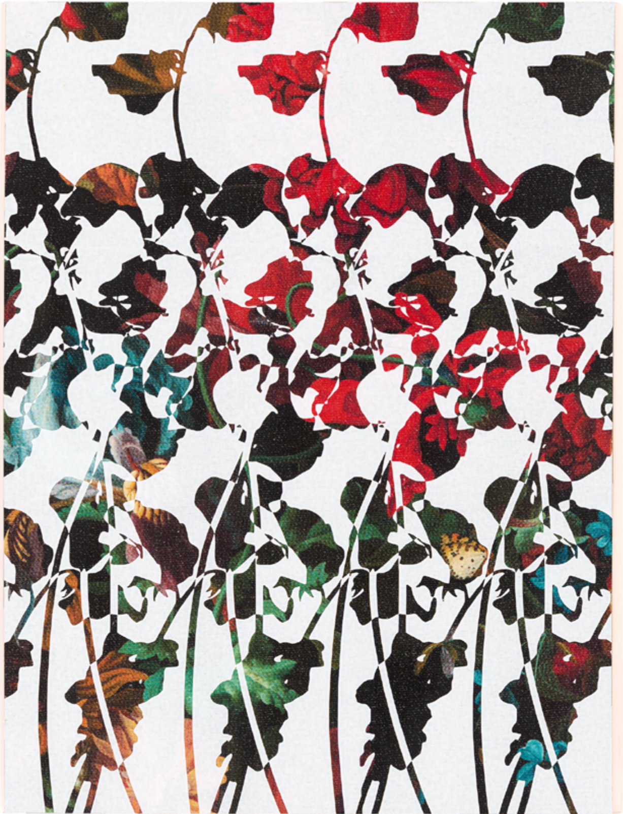
J Myszka Lewis, Botanical Screen 1 , 2023 Acrylic and archival inkjet on canvas mounted to panel; 9 x 12 inches; $350