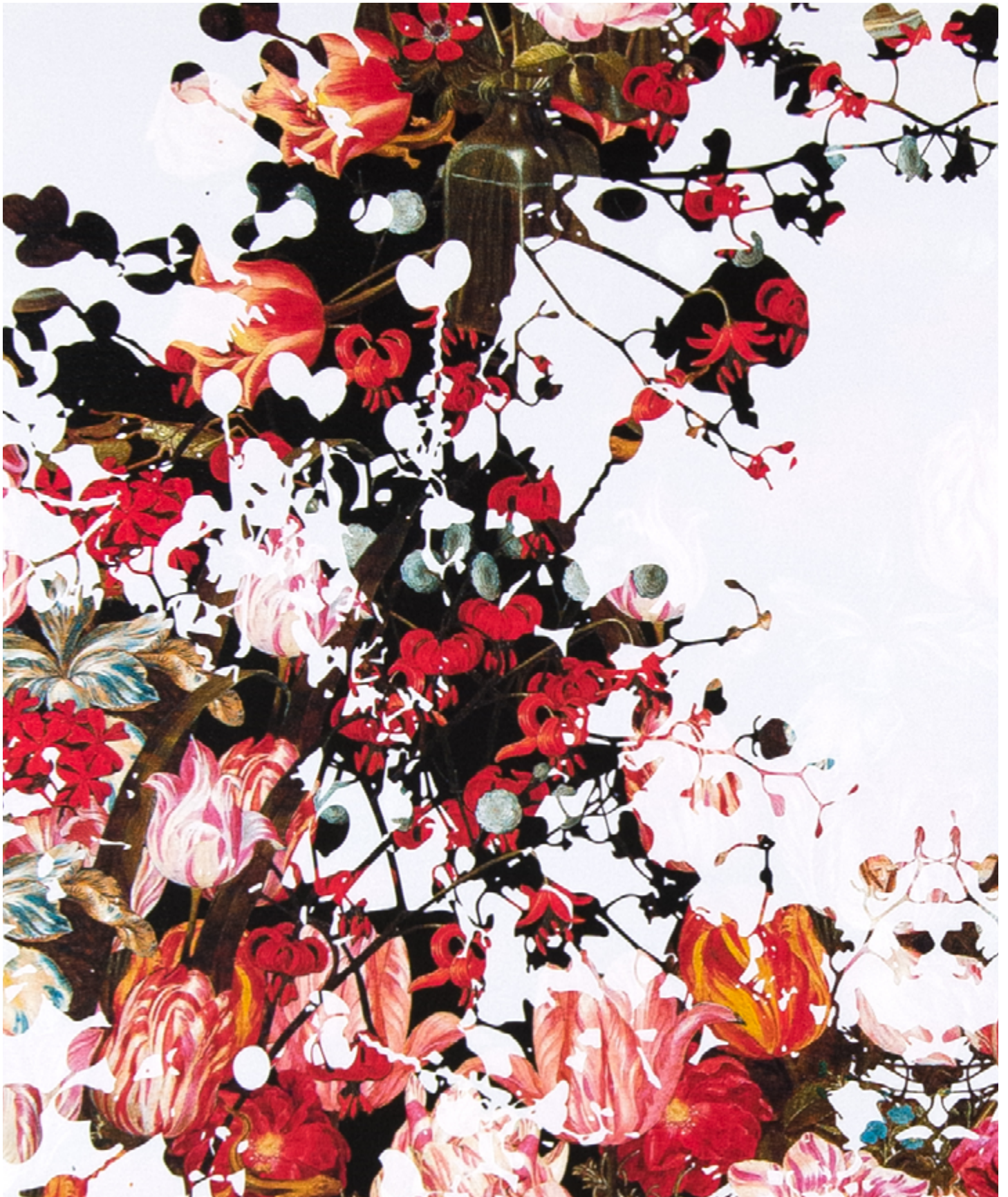
J Myszka Lewis, A Bouquet for Then and Now 5 (oncidium orchid, ranunculus, palm nut) , 2023 detail image