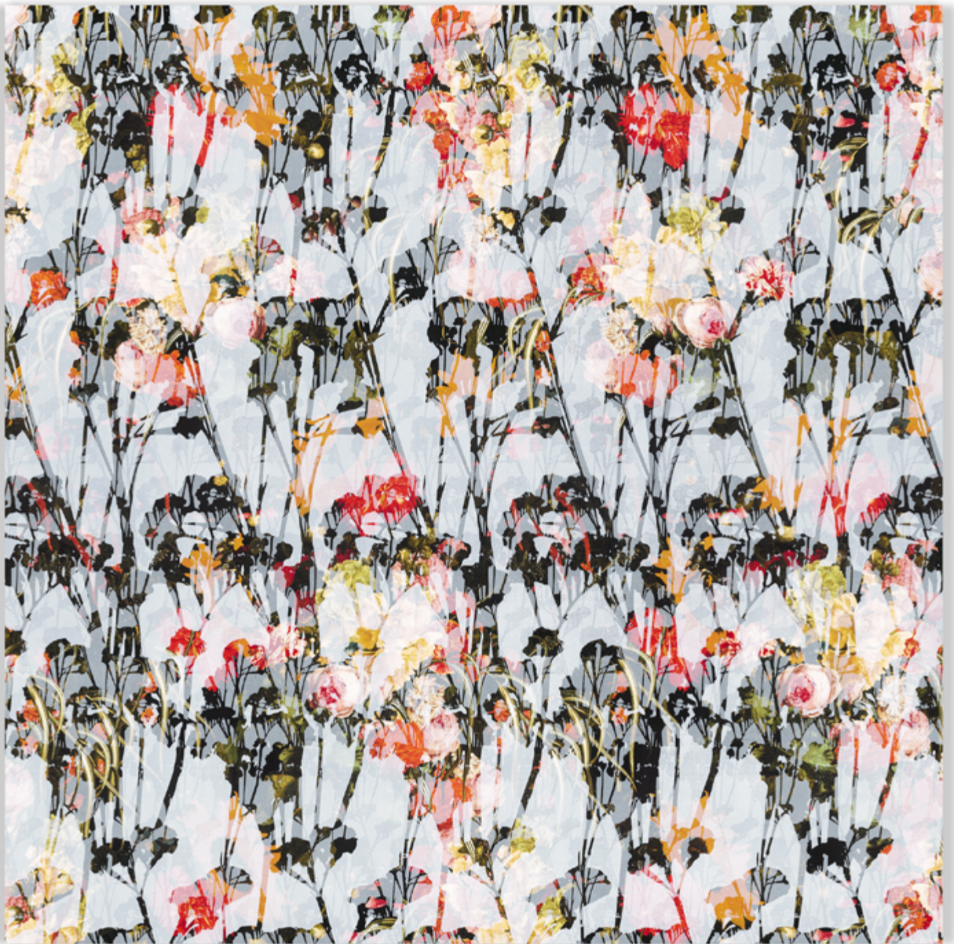
J Myszka Lewis, Flowers from Ghosts (sunflowers) , 2024 Acrylic and archival inkjet on canvas mounted to panel; 36 x 36 inches; $4,500