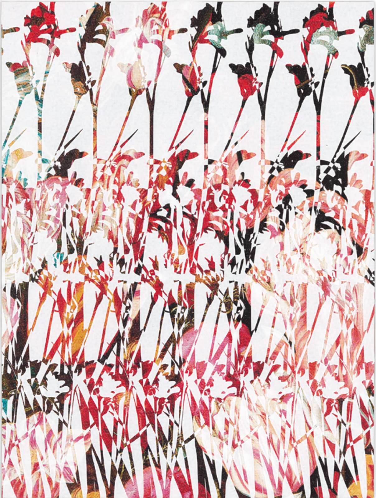
J Myszka Lewis, Botanical Screen 8 , 2023 Acrylic and archival inkjet on canvas mounted to panel; 9 x 12 inches; $350