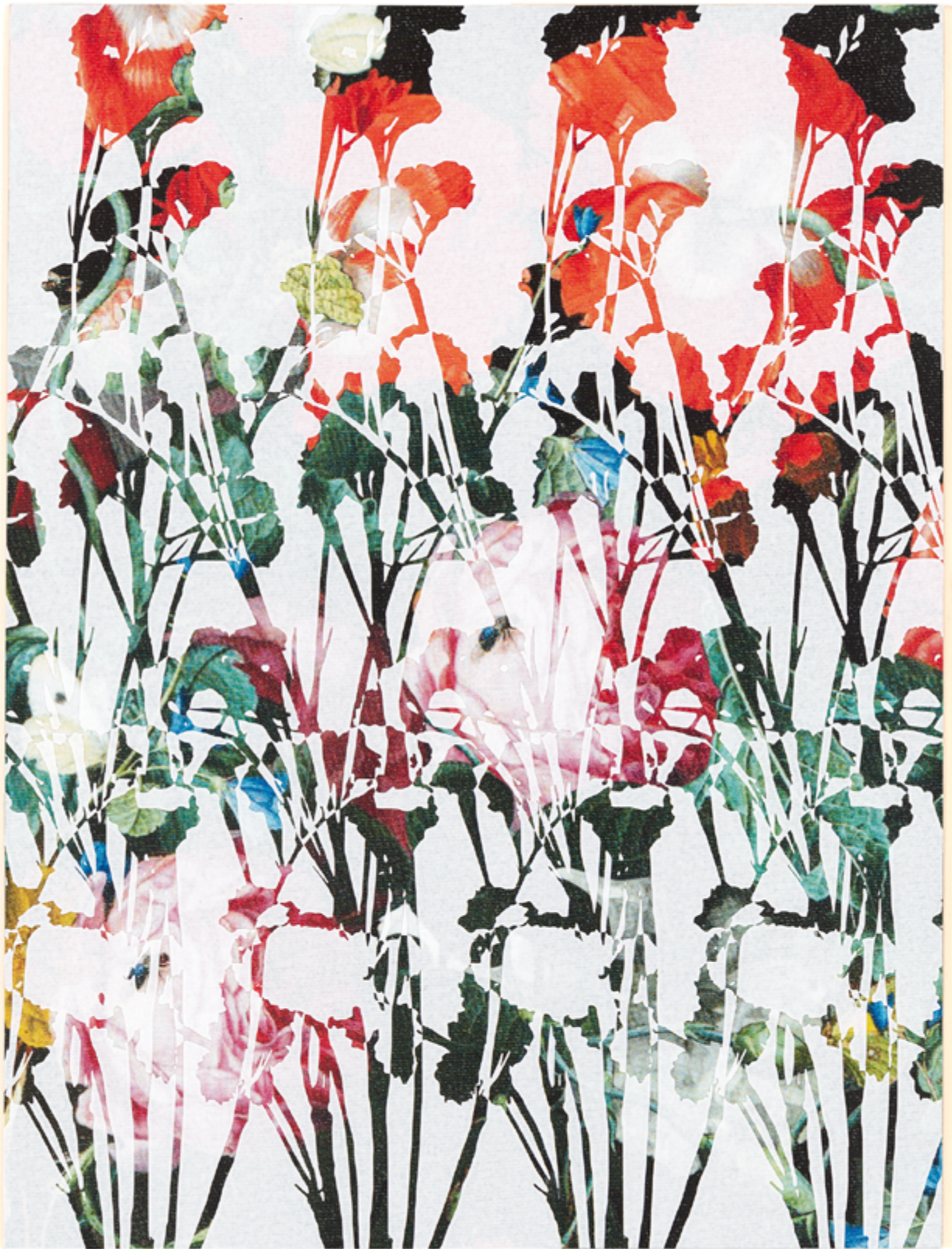
J Myszka Lewis, Botanical Screen 4 , 2023 Acrylic and archival inkjet on canvas mounted to panel; 9 x 12 inches; $350