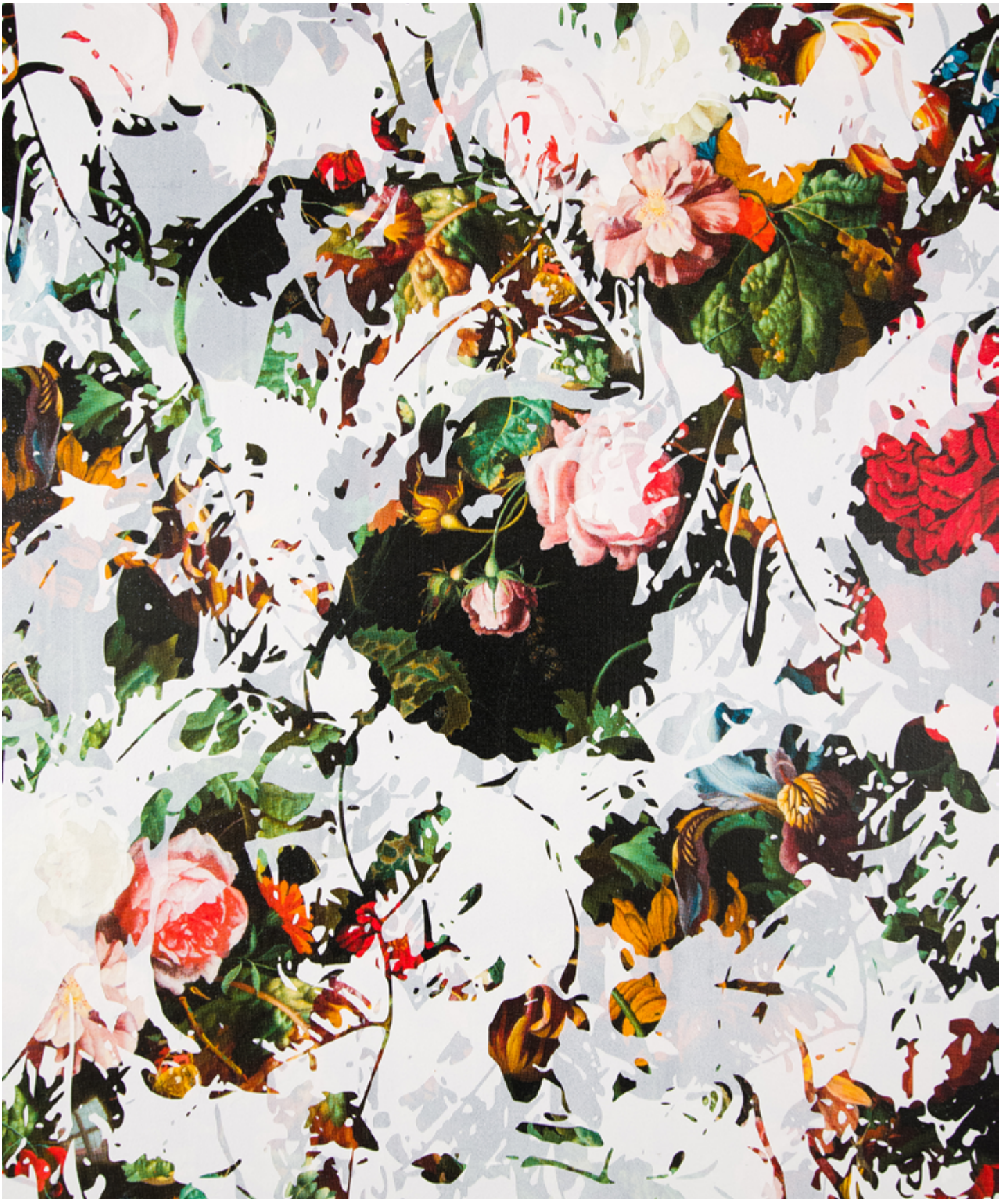
J Myszka Lewis, for we are only the rind and the leaf , 2024 detail image