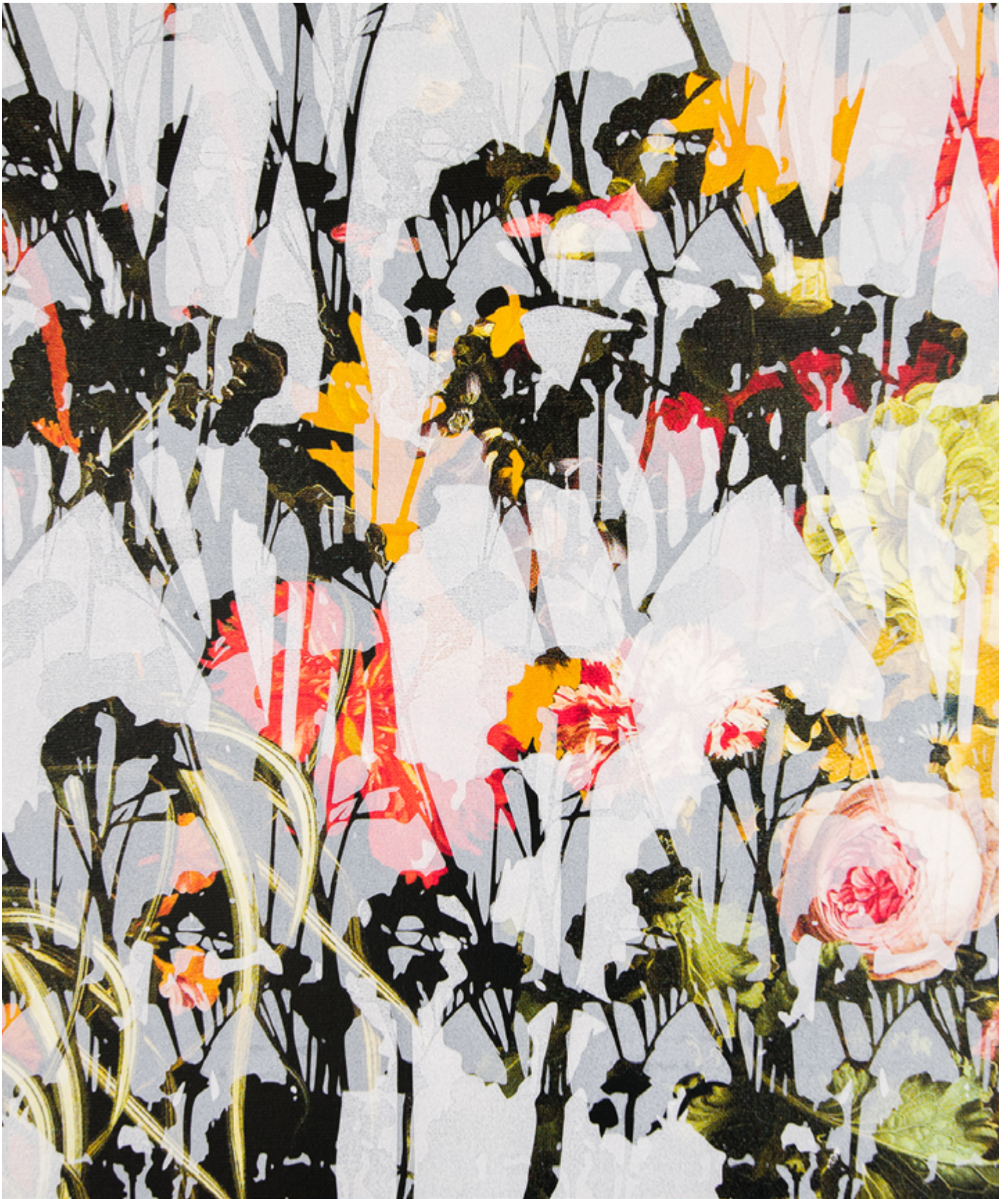
J Myszka Lewis, Flowers from Ghosts (sunflowers) , 2024 detail image