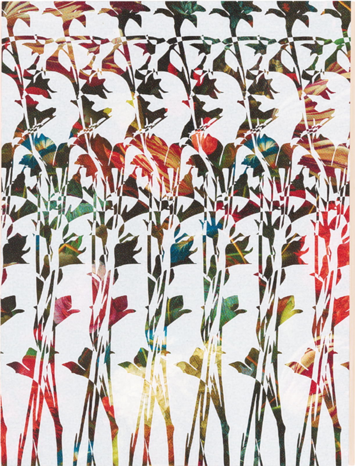
J Myszka Lewis, Botanical Screen 5 , 2023 Acrylic and archival inkjet on canvas mounted to panel; 9 x 12 inches; $350