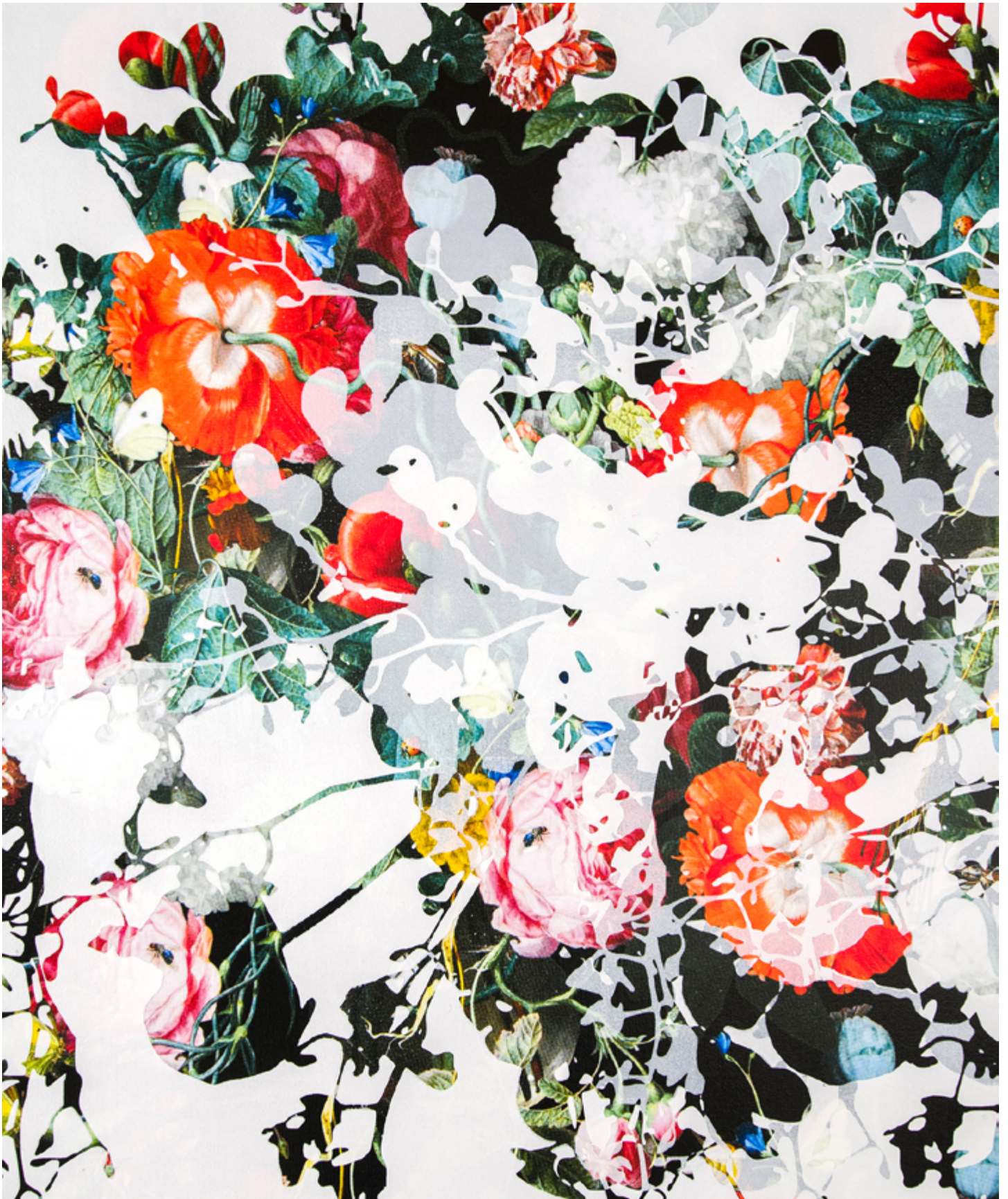
J Myszka Lewis, where moths and flies reside , 2024 detail image