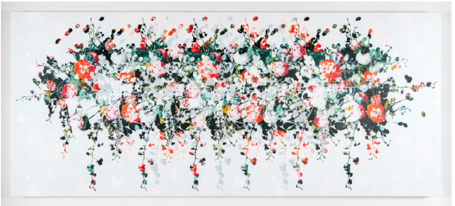
J Myszka Lewis, where moths and flies reside , 2024 Acrylic and archival inkjet on canvas; 36 x 84 inches; $7,500