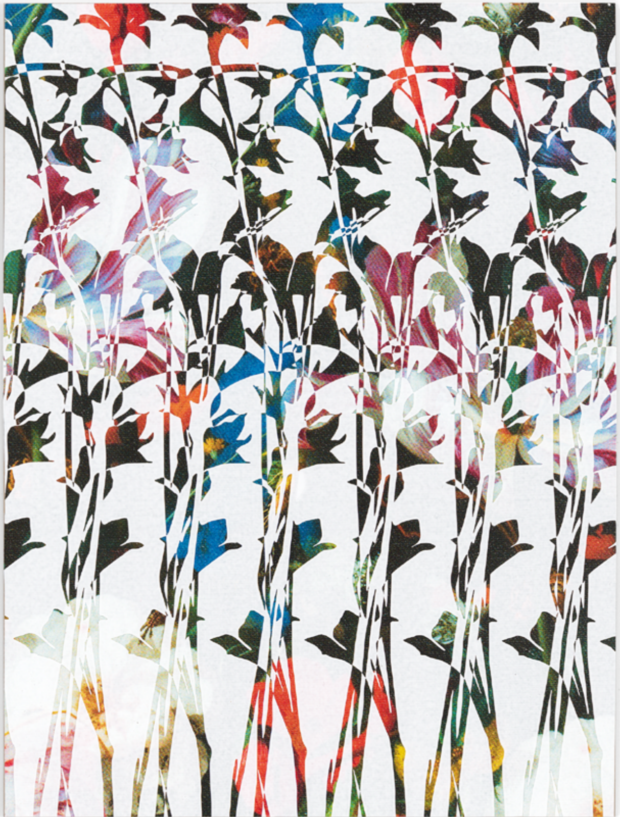
J Myszka Lewis, Botanical Screen 10 , 2023 Acrylic and archival inkjet on canvas mounted to panel; 9 x 12 inches; $350